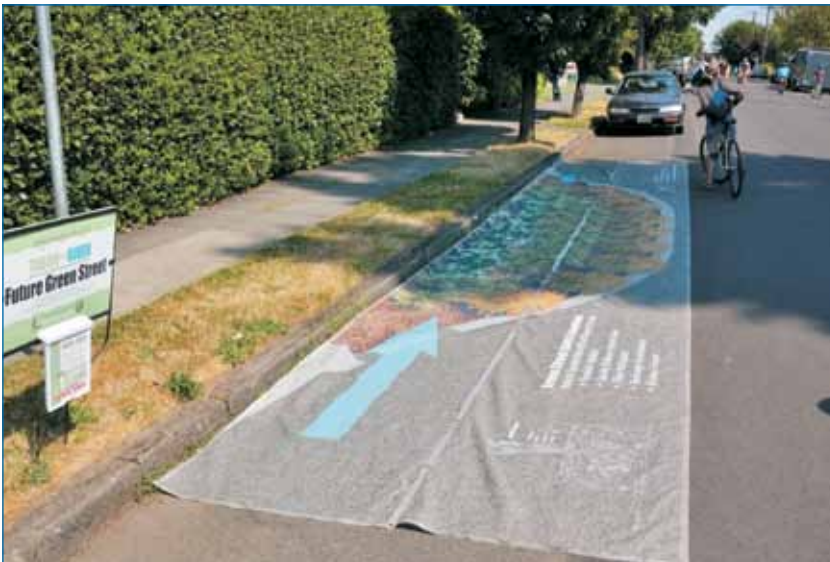
Figure 10 The simple but ingenious Green Street planter rollout

street planters, proudly empowers anyone with the inclination to stop and read, precisely what the structures achieve in terms of surface water management.