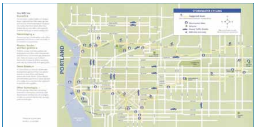
Figure 6 Stormwater cycling tour guide

As the implementation of the various SuDS structures became commonplace across Portland, so the diversity and availability of outreach collateral increased. Perhaps the most inventive and seemingly ambitious example of the outreach is the Stormwater cycling tour (Portland Bureau of Environmental Services, 2011). This guide (Figure 6) details a 21-stop cycling tour around Portland's city centre that visits an array of SuDS implementation sites, with explanations of how the techniques work that empower the public in a cost-effective and multiple beneficial way, ie by encouraging outreach collateral for the public (citizens and visitors) to embark on city centre cycling tour to visit SuDS locations. And with notable subtlety, the tour ends back at the Willamette River waterfront and encourages people to stop and read the interpretive signs along the river bank, which highlight the importance of good river health. This initiative also supports the aim to promote good health through exercise for the citizens of Portland. There is also a similar themed walking tour around nearby Portland State University.