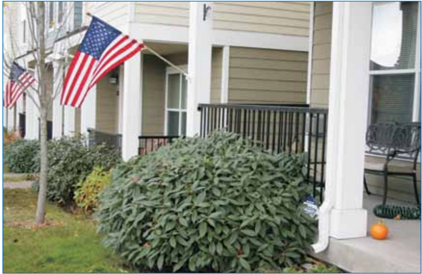
Figure 3 Disconnection in the USA

SuDS components used on the Green Streets include rain gardens, roadside swales, surface water street planters in various guises, green roofs and a downspout disconnection programme second to none. Operating as a surface water management train they are all aesthetically incorporated into the urban landscape and it's difficult to argue against the value of such