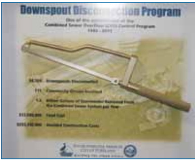
Figure 2 The disconnection numbers that matter from the City of Portland