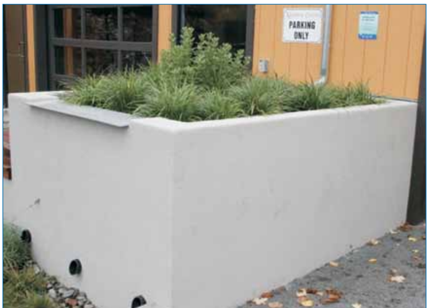
Figure 4 A disconnection planter serving a commercial property (note outreach plaque on the wall)

street trees planted (Figure 2). The extraordinary facts and figures continue with the Downspout Disconnection Programme that ran between 1995 and 2011 (although disconnection continues), with over 56 000 downspouts now disconnected from the combined sewer network and this included over 26 000 residential homes partly or completely disconnected (see Figures 3 and 4). So how did the City of Portland achieve such success with their Green Streets SuDS implementation? Incentivisation has played an important part of the success of that there is no doubt. $53 per downspout disconnected will obviously induce many and prevent “pushback”. The Clean River Rewards