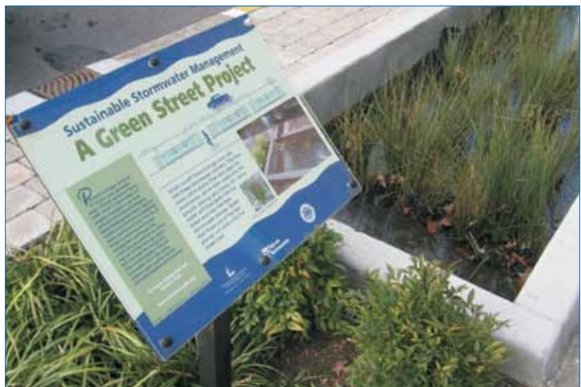
Figure 9 A definitive Portland Green street planter, with informative signboard

Siskiyou Street as the perfect place to construct and adopt the first kerb extended and multiple benefit surface water planters (Figure 9). A mini competition in the neighbourhood confirmed NE Siskiyou Street as the chosen site, but it was stated that after the planters were completed, if the local residents decided that they were not pleased with the end result, they would have been removed. However, the opposite occurred: not only were the residents of NE Siskiyou Street delighted with the traffic calming and fully functional SuDS components, but they also provided occasional light maintenance and tended to the plants. And the visible signboards that still adorn the two