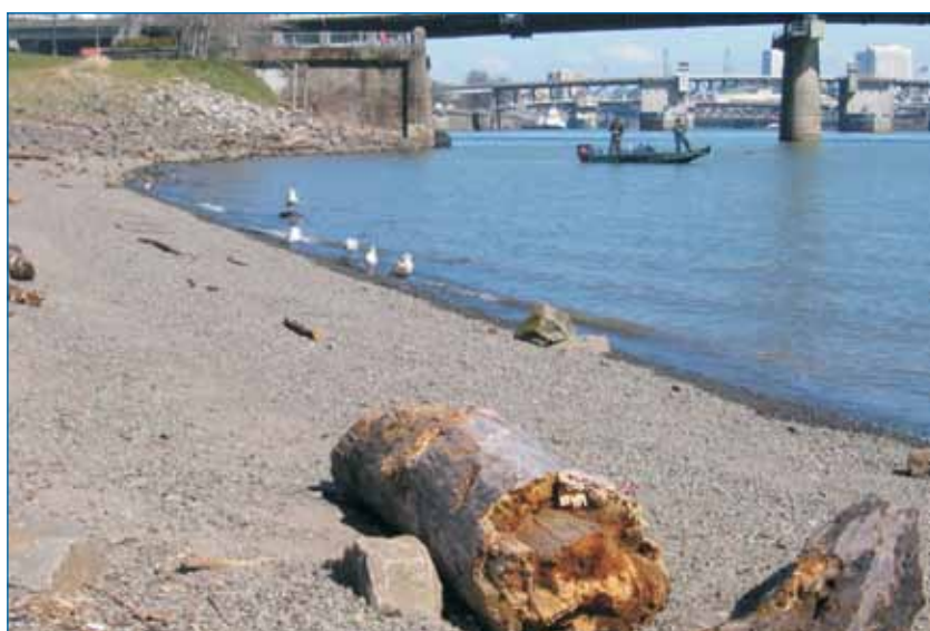
Figure 1 Amenity and biodiversity, the Willamette River in Portland, Oregon

River pollution was greatly exacerbated by decades of numerous CSO spills (Portland has large catchment areas of combined sewerage), which annually contributed to the estimated 100 days and 10 billion gallons of combined sewer discharge into the Portland waterways, adding unwanted bacteria such as Escherichia coli (E coli) to the rivers. Portland’s response was the 20 year Big Pipe project, which was completed at a $1.4bn cost by the self-imposed deadline of 1 December 2011 (and was largely funded by a five-fold increase in domestic sewage bills) a success widely reported in the Oregon press. The project was the most ambitious and expensive public works project undertaken by the City and resulted in three substantial storage tunnels: Columbia Slough (2000), West Willamette (2006) and East Willamette (2011). The original target of reducing untreated sewage spills into the Willamette was achieved and CSO spill frequencies are now one in three years in summer conditions – people now swim in the Willamette once more.